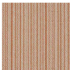
AK3583RS (Stripe pattern of AK3515, AK3516, and AK3522.)