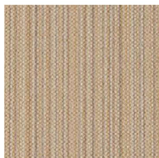
AK3581RS (Stripe pattern of AK3515, AK3516, and AK3518.)