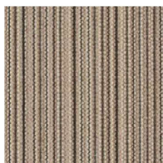
AK3582RS (Stripe pattern of AK3515, AK3518, and AK3523.)